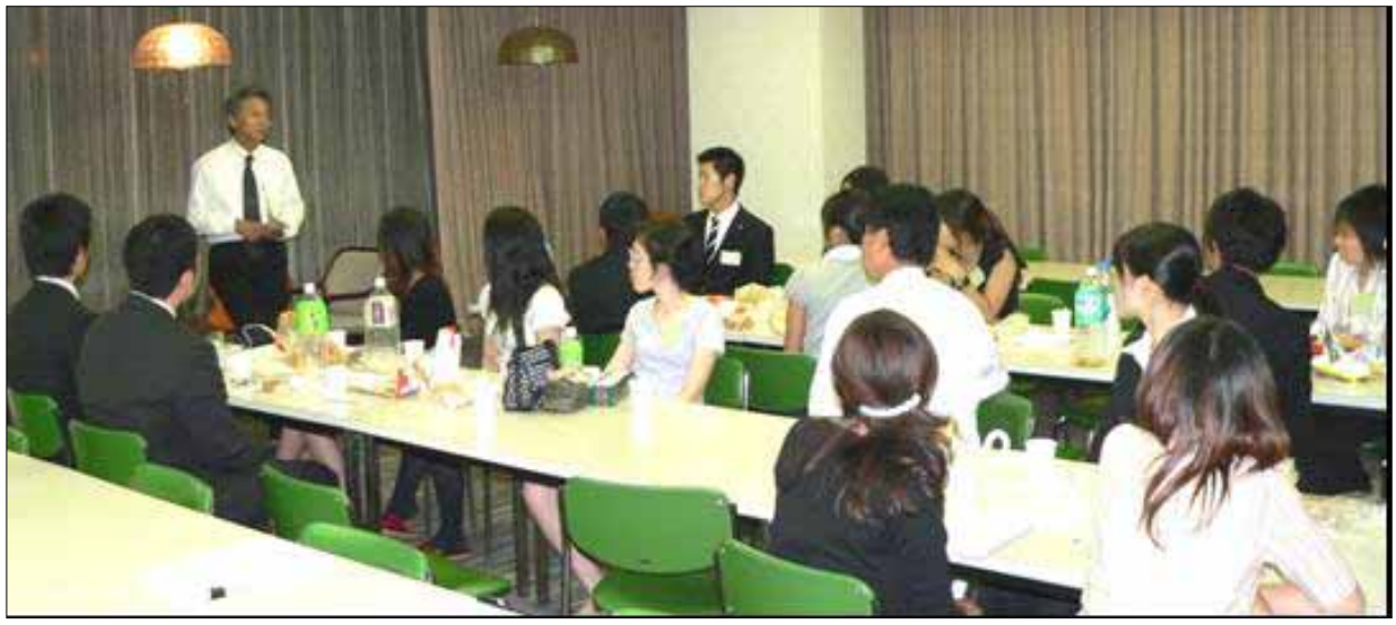
Singapore students who participate in the industrial attachment programme also join an exchange programme with the staff of Hiroshin Bank and enjoyed discussing various themes.