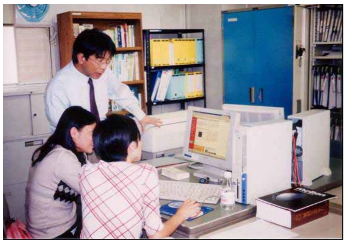
Singapore students learning company activities at Molten.