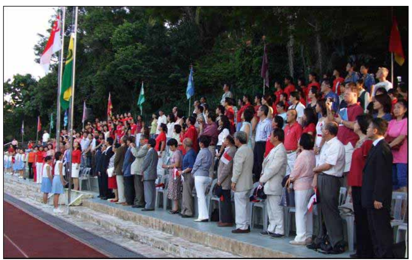
A group of the Hiroshima Singapore Association attended the National Day Ceremony of the Singapore Chinese Girls School in 2007.

718 Singaporeans have visited Hiroshima in our Programme