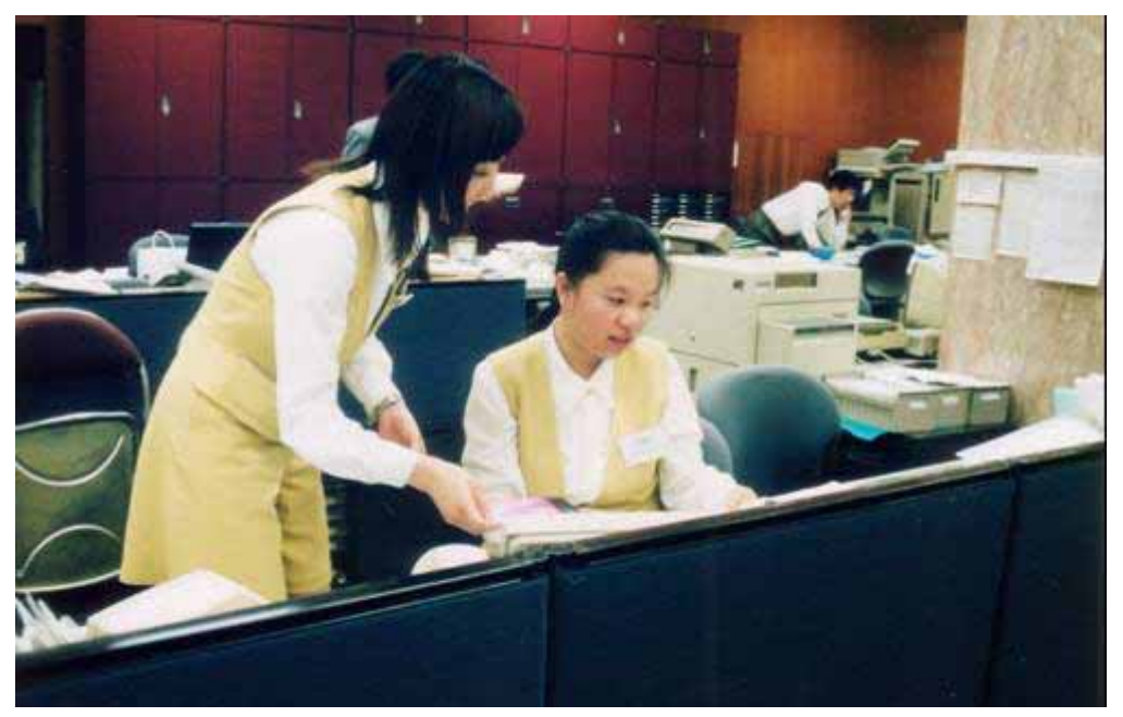
A Singapore student learning bank-telling at the Hiroshima Shinkin Bank.